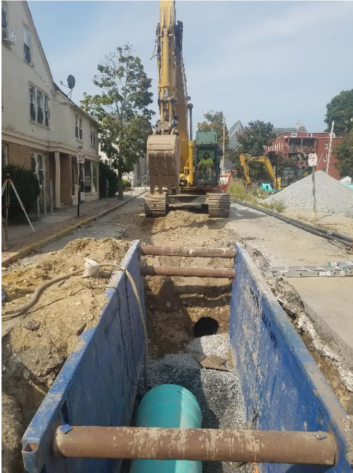
Figure 5 - Elm Street sewer replacement