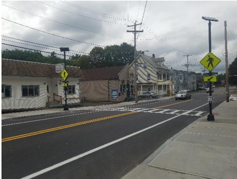
Figure 2 - New RRFB on Westminster St