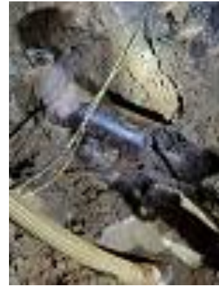
Figure 3 - Water Main Break