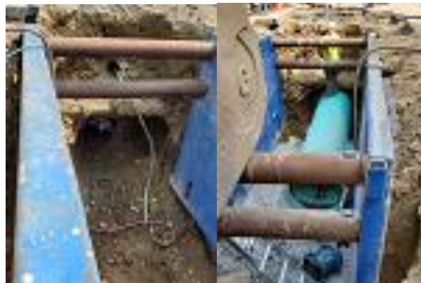
Figure 4 – Water main over sewer line